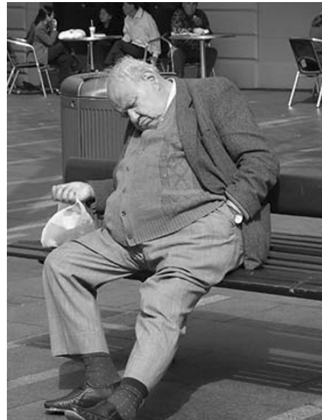
An ex-Coastie reminiscing about his boot camp days at Cape May

August 6, 2004, is Coast Guard Day at the USCG Academy in New London, Conn. If anyone would like to join me at this event, please let me know