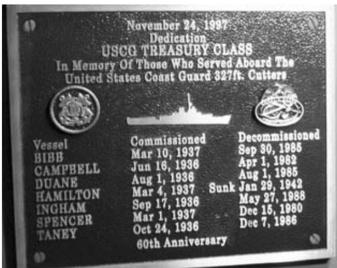
The 327 Memorial Placque at Curtis Bay Yards

Send your expression of interest to me and don't worry about being held to that. I just need a rough head count.